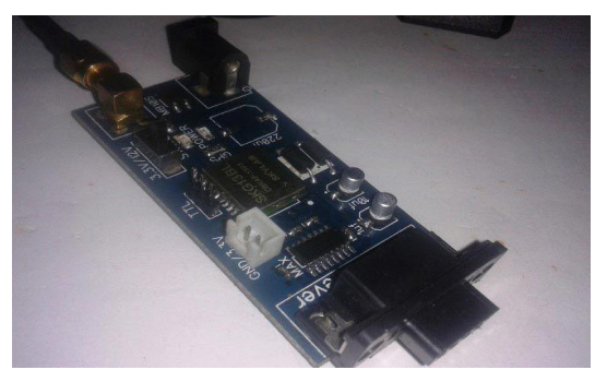
Fig 7. GPS module SKG13BL

weather conditions primarily developed it. The Global Positioning System (GPS) is the only fully functional Global Navigation Satellite System (GNSS). Utilizing a constellation of at least 24 Medium Earth Orbit satellites that transmit precise microwave signals, the system enables a GPS receiver to determine its location, speed, direction, and time. It have 65 channels with ultra-high sensitive It is capable of receiving signals from up to 65 GPS satellite and transferring them into the precise position and timing information that can be read over either UART port or RS232 serial port.