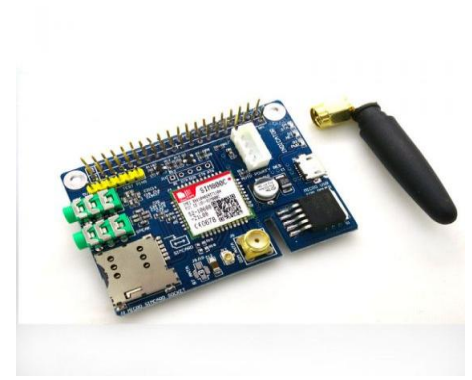
Fig 6. SIM 800c GSM Module

GSM is a cellular network, which means that cell phones connect to it by searching for cells in the immediate vicinity. There are five different cell sizes in a GSM network macro micro, pico, femto and umbrella cells. The coverage area of each cell varies according to the implementation environment.