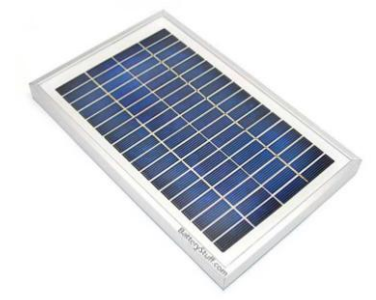
Fig 2. Solar Panel

Age of an electromotive power because of retention of ionizing radiation is known as photovoltaic impact. Antireflective coating (arc) is an essential part of a solar cell since the exposed silicon has a reflection coefficient of 0.33 to 0.54 in the spectral range of 0.35 to 1.1 m. The cells produced using mix of gallium aluminum and gallium arsenide.