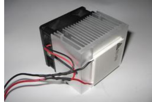
Fig 4. Peltier Plate

A typical thermoelectric module consists of an array of Bismuth Telluride semiconductor pellets that have been "doped" so that one type of charge carrier- either positive or negative- carries the majority of current. The pairs of P/N pellets are configured so that they are connected electrically in series, but thermally in parallel. Metalized ceramic substrates provide the platform for the pellets and the small conductive tabs that connect them. When DC voltage is applied to the module, the positive and negative charge carriers in the pellet array absorb heat energy from one substrate surface and release it to the substrate at the opposite side. The surface where heat energy is absorbed becomes cold; the opposite surface where heat energy is released, becomes hot. Reversing the polarity will result in reversed hot and cold sides.