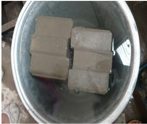
Fig 3.6 Water absorption test

Water absorption of bricks is not related directly to the porosity owing to the nature of pores themselves. Some of Pores may be through pores which permit air to escape in absorption tests and allow free passage of water in absorption tests, but other are completely sealed and inaccessible to water under ordinary conditions. For this reason it is seldom possible to fill more than about three quarters of pores by simple immersion in cold water. For measuring total absorption the boiling method is adapted. More is the water absorption capacity weaker is the brick and vice versa.