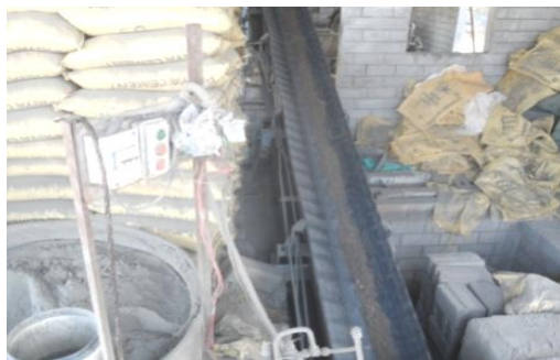
Fig 3.3 belt conveyor

After the collection and proportion of materials casting process is carried out. The materials are proportioned by the weight batching. The interlocking bricks are casted in a manufacturing industry. Mixing of materials is done in the machine. Then the raw materials are transported to the interlocking brick casting machine by the use of conveyors.