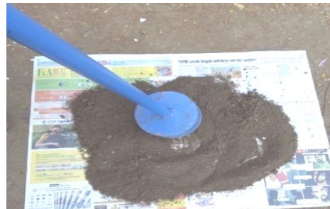
Fig 3.1 Damping of sludge

The sewage sludge collected from water treatment plant are damped and sieved by using dampers and 300micron sieve. The damping and sieving process of sludge are carried out for 2weeks and the required final product of finely sieved sludge are used for casting interlocking bricks.