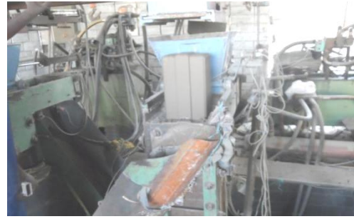
Fig 3.4 Casting of interlocking brick