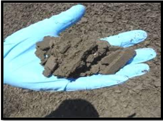
Fig 2.1 Sewage Sludge

materials such as fly ash, cement, stone dust collected from the brick manufacturing site.