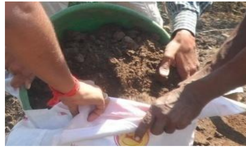
Fig 2.2 Sludge

materials such as fly ash, cement, stone dust collected from the brick manufacturing site.