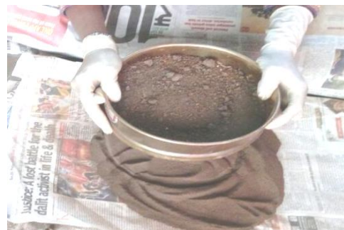
Fig 3.2 sieving of sludge