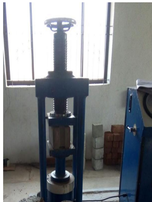
Fig 3.7 CTM Testing

recorded from the meter of the compression testing machine.