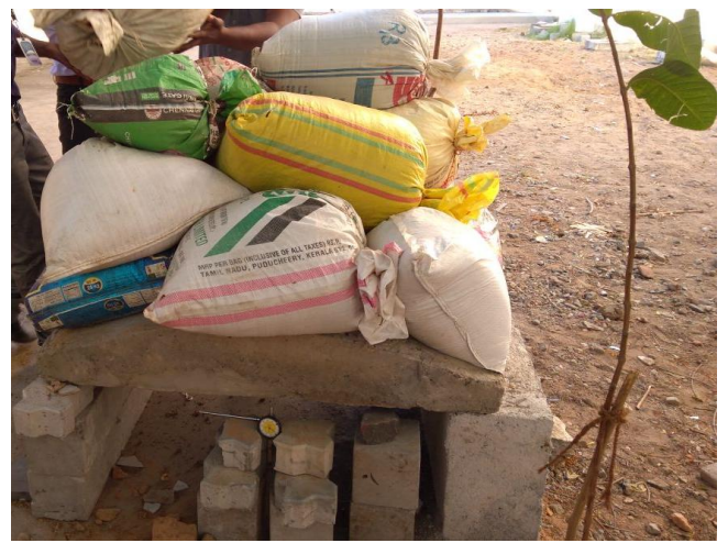
FIG.1 LOAD APPLIED ON SHELL

Load testing was done by placing weighed sand bags contain about 40 to 90 kg sand on the top surface of shell. As the specimen is deformed, the soil is also deformed. And corresponding strain on the strain gauge and deflection on dial gauges are taken print out from data logger connected to the gauges at the various stages of loaded. The cylindrical shell corresponding to withstand the maximum load respectively. Here the failure has occurred suddenly without any warning. And the failure pattern is seems to be a pure structural failure by means of reverse buckling which otherwise known as snap through buckling.