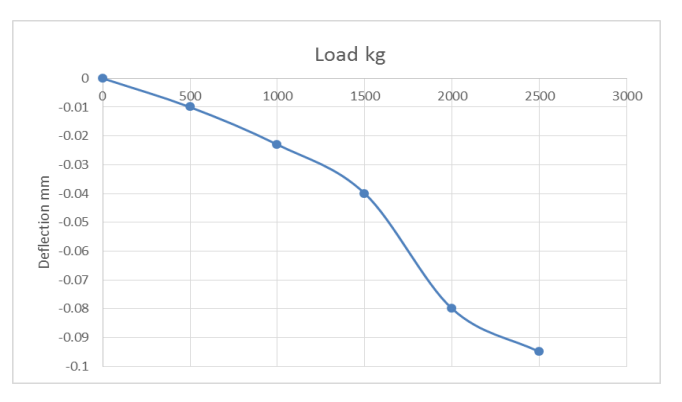
FIG.2 DEFLECTION GRAPH References

Analytical results has not close agreement with the experimental results and few results were not promising each other due to the error in the material model observe from the experiment.