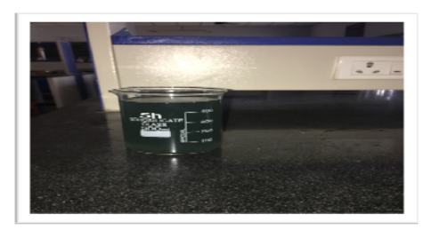
Fig 2.Collected Sample

The textile dye wastewater was collected from a private small-scale industry located at Tiruppur, Tamilnadu, India. The wastewater was analysed for various parameters as per the procedure. The wastewater was stored at room temperature (35°C) in airtight plastic containers.