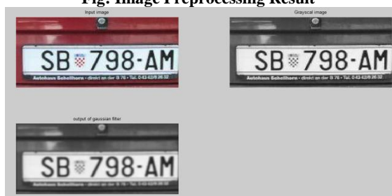
Fig: Image Preprocessing Result

In preprocessing step, we first utilised grayscale conversion, which is convert the RCB(24 bit) to gray image (8 bit). The RGP doesn't help us identify important edges or other features. The gray(black and white) image is the range of white(255),black(0). The gray image may lost low contrast, remove shadows. The bits are representation by unit 8, unit 16. The next utilised Gaussian filter, it will blur the edges and reduce contrast, which is used to remove the noise and smoothing the image.