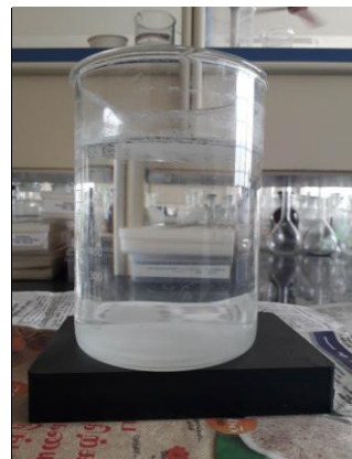
Figure1. Magnetizing Normal Water

The Magnetic water means the water which is treated in the magnetic field. Here, the magnetic water is prepared by placing 1 litre of water in a glass beaker above 1T magnet for a period of 24 hours. While placing the water over magnet, magnetic field passes through the water and it gets magnetized.