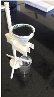
Figure 2. Filtration of Industrial Waste Water

The industrial waste water (dye industry) is primarily treated using the activated carbon (rice husk). The activated carbon (rice husk) is prepared by heating the rice husk at high temperature. The industrial waste water is filtered using this activated carbon. Then the treated industrial water is magnetized using the 1T magnet for the period of 24 hours.