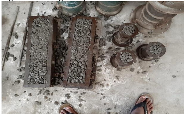
Figure:1: Casting of a specimens

The cube of size 150mm*150mm*150 mm, the prism of 50mm*10mm*10mm and the cylinder of 100mm diameter and 200mm long has been used. Figure No.1 shows a specimen casting.