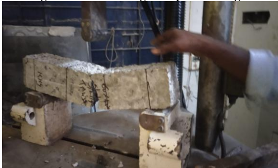
Figure No.2B : Testing for a prism strength