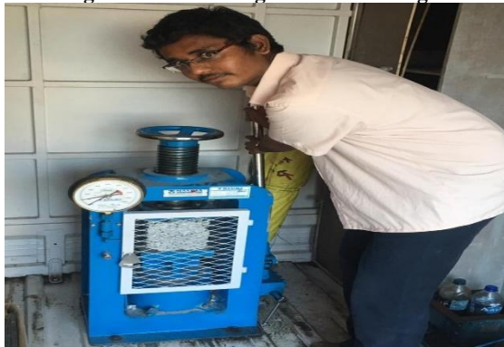
Figure No.2B : Testing for a prism strength