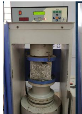
Fig 3.3.1 Compressive Strength Testing