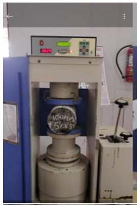
Fig 3.4.1 split tensile strength testing