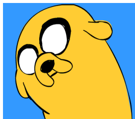
Fig 3 Input.gif

In the Digital image watermarking using DCT and DWT concept Graphical Interchange Format (GIF) is used to hidethe secret messages (data) from the unauthorized user.