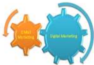
Fig 1 Digital Marketing

Digital Marketing is a new technology to promote the business. It has many techniques to promote a business. Enterprises are started using this promotion approaches. Mobile marketing is one of the digital marketing techniques. In this, mobile phones are used to identify and to understand the users about the product.