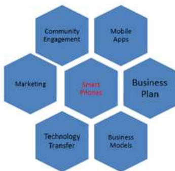
Fig 2 Mobile Marketing