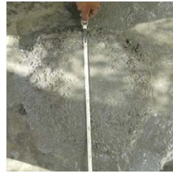
Fig.1 Slump Flow Test

circle is a measure for the filling ability of concrete. This test gives good assessment on the filling ability of the concrete and some indication of resistance to segregation.