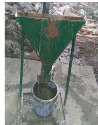
Fig.2 V-funnel Test

The equipment consists of a V-shaped funnel, shown in Fig. The described V-funnel test is used to determine the filling ability (flow ability) of the concrete with a maximum aggregate size of 20mm. The funnel is filled with about 12 liters of concrete and the time taken for it to flow through the apparatus measured.