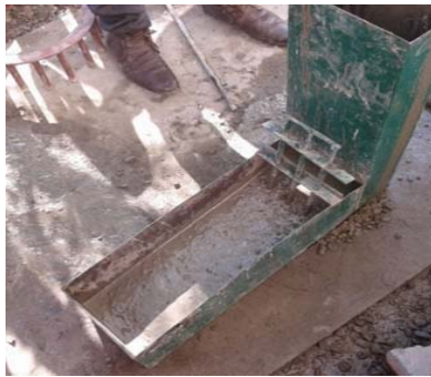
Fig.3 L-Box test

The horizontal section of the box can be marked at 200mm and 400mm from the gate and the times taken to reach these points measured. These are known as the T_{20} and T_{40} times and are an indication for the filling ability. It assesses filling and passing ability of Self Compacting Concrete, and serious lack of stability (segregation) can be detected visually.