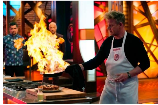
Fig. 1 Gordon Ramsay cooking while shooting Master Chef

Reality Cooking shows have significantly impacted the increasing popularity of culinary arts. These shows have effectively fostered a new wave of food enthusiasts, both in terms of cooking and dining [3]. Through these shows, people have developed a greater interest in cooking and have come to appreciate good food more, resulting in a renewed enthusiasm for home cooking and exploring new recipes [3]. The rise of celebrity chefs has brought about a transformative change in the culinary industry, and food TV shows have been instrumental in providing them with a platform to gain widespread recognition. Through cooking competitions, reality shows, and culinary demonstrations, chefs have exhibited their skills and personalities, ultimately amassing a significant following and immense popularity. Renowned chefs like Gordon Ramsay and Ranveer Brar have become synonymous with the culinary world, and their names are familiar in households worldwide. Approximately 500 cooking shows are broadcast on TV channels worldwide daily, with almost 3.5 billion viewers [4].