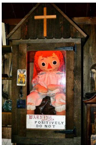
Fig 3: Annabelle in Warren museum