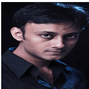
Fig 2: Gaurav Tiwari

Gaurav Tiwari (2 September 1984 – 7 July 2016) was Founder and CEO of Indian Paranormal Society.