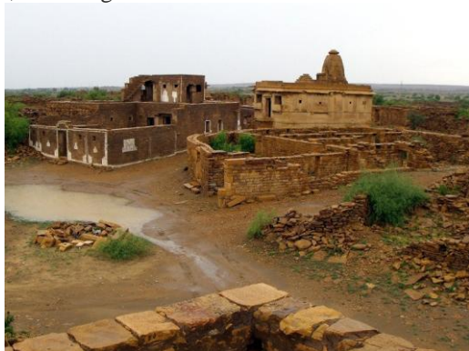
Fig 5: Kuldhara Village