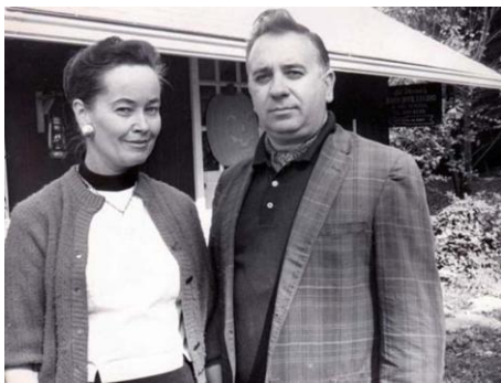
Fig 1: Warren Family

Edward Warren (September 7, 1926 – August 23, 2006) and Lorraine Rita Warren (née Moran ; January 31, 1927 – April 18, 2019) were American paranormal investigators and authors associated with prominent cases of hauntings. Edward was a self-taught and self-professed demonologist, author, and lecturer. Lorraine professed to be clairvoyant and a light trance medium who worked closely with her husband.