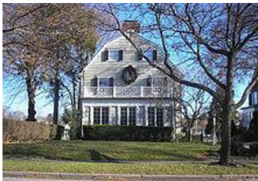
Fig 4: Amityville House

According to the writings, on November 13, 1974, Ronald DeFeo Jr. shot and killed six members of his own family at 112 Ocean Avenue, a large Dutch Colonial house which is situated in a suburban neighbourhood in Amityville, on the south shore of Long Island, New York. He was convicted of second-degree murder in 1975 in the month of November.