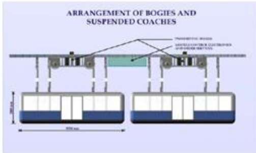
FIGURE: - 2 ARRANGEMENTS OF BOGIES AND SUSPENDED COACHES