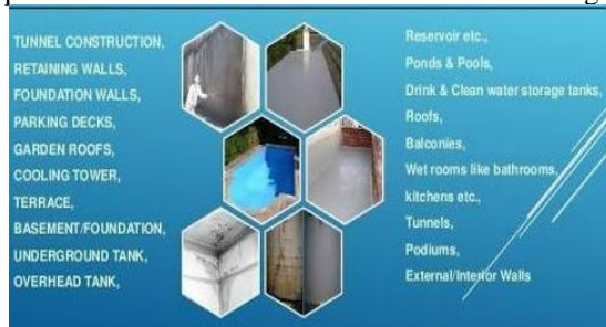
Figure 6.1 shows the application of water proofing.

A water proofing material mixed with polymer fillers and UV rays which give environmental changes in temperatures in internal structures this can be done various application paints and insultec coatings.