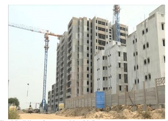
Fig. 3 Building after assembly of 3-S precast concrete construction system