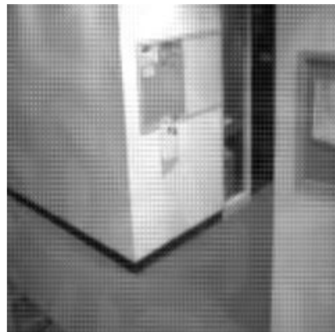
Fig-7: Video Frame after Resizing