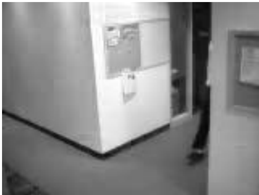
Fig-3: Original Video