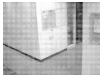
Fig-8: Video Frame after Gamma Correction