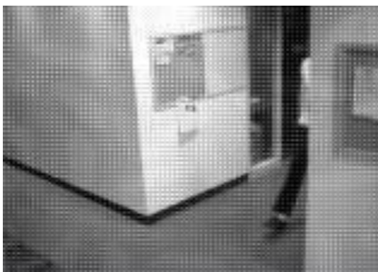
Fig-5: Watermarked Video