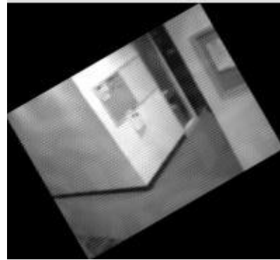
Fig-6: Video frame after rotation by 180 degrees