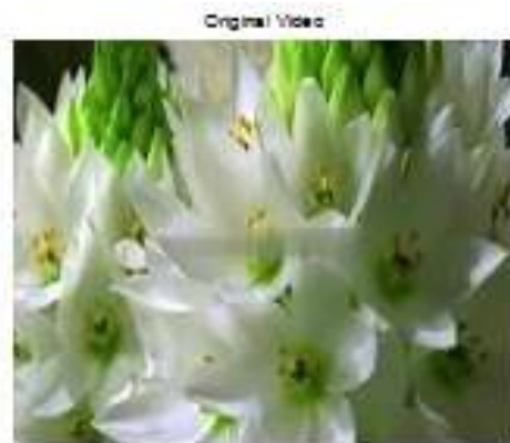
Fig 4: Original video frame

For testing the functioning of this algorithm, the experiments is simulated with the MATLAB [14]. In the following experiments, the RGB video with a size of 1.78 MB is used as host video to embed watermark. In that video the total frames are 225 and 25fps the embedded process occur.