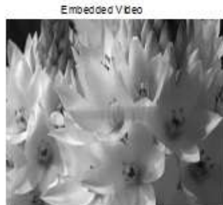
Fig 5: Watermarked video frame