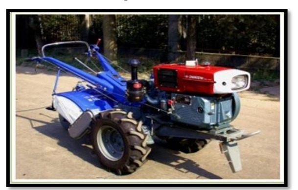
Fig.2 Power Tiller sprayer

Power Tiller Mounted Orchard Sprayer: It consists of an HTP pump, trailed type main chassis with transport wheels, chemical tank with hydraulic agitation system, cut off device and boom equipped with turbo nozzles. It is fitted with turbo nozzles with operating pressure of 9-18 kg/cm<sup>2</sup>. It generates droplets of 100-150 micron sizes. Depending upon the plant size and their row spacing, the orientation of booms can be adjusted. The spray booms are mounted behind the operator.