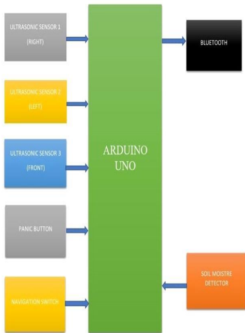
Block diagram of Smart Blind Stick (Transmitter)