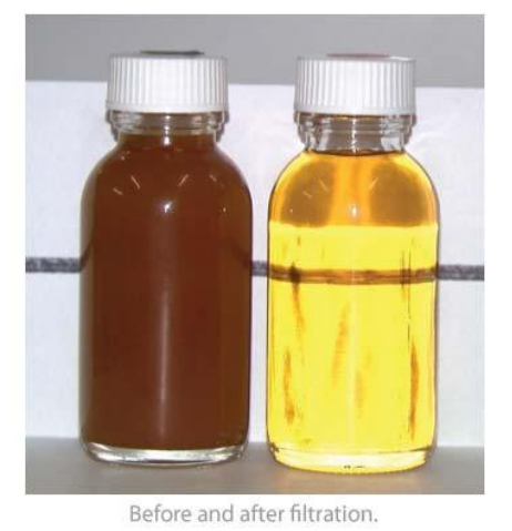
Fig 2: Transformer Oil Before and After Filtration

Transformer oil filtration machine consists of inlet pump, filters, heaters, ionic reaction column, degassing and dehydration chamber, discharge pump, vacuum pumps etc. Inlet pump pumps the contaminated oil from transformer to oil filtration machine. Heaters heats the oil up to 60 to 70 degree Celsius. Oil is heated to make the purification process faster. An ionic reaction column is provided to reduce the acidity in the oil. Filters are provided for the removal of suspended particles, sludge content in the oil. The degassing and dehydration chamber is provided for removal of dissolved gases and moisture from the oil. Vacuum pumps are provided for evacuation of degassing and dehydration chamber. After three to five passes in transformer oil filtration machine the contaminated transformer oil is purified.