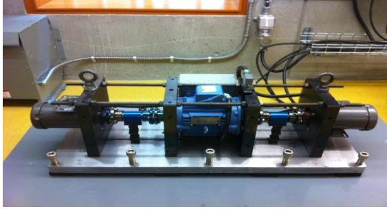
Figure 1.1 Load sharing motor test bench used for the practical observations.

The survey schematic of the test situate is outlined in Figure 1.1. In the considered motor seat with three machines showed up in detail in Figure 1.1, two IMs assessed 1HP and evaluated 5HP were coupled on a run of the mill shaft and thought to drive a regular mechanical load duplicated by the remaining third motor. The proposed scheme is realized by using one of the motors, Motor 3 (1HP), as a load and interchange motors (Motor 1 (1HP) and Motor 2 (5HP)) for driving this store. As two indistinct motors with different rotor securities were not available, we used two dissimilar motors, 1HP and evaluated 5HP, for the investigation. These motors are powered using VFDs which are continue running in V/F control. The particulars of the VFDs used as a piece of the set-up are dense in the Appendix B. The PLC is used to impersonate the control as illuminated in the past regions. In the pondered configuration, Motor 1 (1HP) and Motor 2 (5HP) are speed referenced with 1507.3 rpm threatening to clockwise bearing; while the Motor 3 (1HP) is torque referenced to continue running at 100% stacking clockwise to mirror a regular mechanical load of 4.05 N.m . The plenitude imperativeness from Motor 3 (1HP) is being dumped through the VFD 3 into a right hand breaking resistor box.