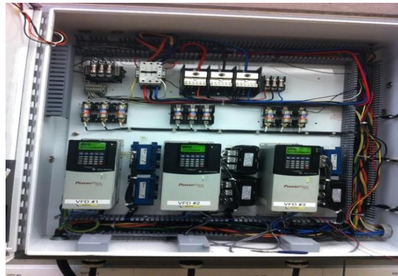
Figure:1.3 circuit diagram