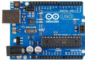
Fig 1: Diagram of AT mega328