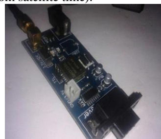
Fig 3: GPS module

GPS satellites continuously transmit data approximately their course time and site. A GPS receiver track multiple satellites and solves equations to determine the precise position of the recipient and its deviation from true tempo. At a leas, four satellites must be in view of the receiver for it to rate four hidden quantities (three position coordinates and beetle straying from satellite time).