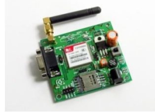
Fig 2: GSM Module