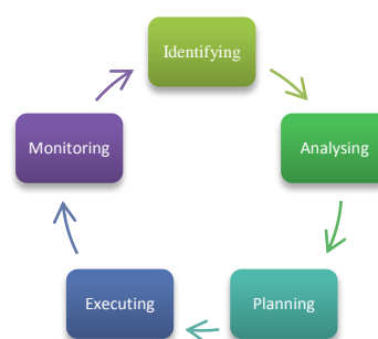
Figure 1: Stakeholders Management Cycle

The following figure gives an overview of the management processes of the project stakeholders.