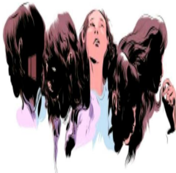
Figure 1: women under threat

according to December-21-2012 –says that seven out of ten are sexual harassed. As per recent report against the girl child abuse rate says that for every hour four children are victims for sexual abuse, now days result on rape has terrified us. Our society has programmed to remain silent about sexual abuse. Most horrible, November-3-2017 a 1year old girl was raped by 33year old neighbor in outer Delhi [1]. A girl is confused about her society and their way of thinking is shown in figure-1.