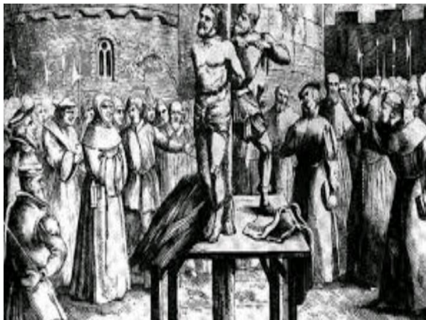
Figure-3: Methods, Man being executed in public [10].

Figure-4 shows the methods that might save countless number of women in world from rape and sexual assaulting. So, people will sure stop committing sexual attack on women all because of fear of horrific death sentence in front of public.