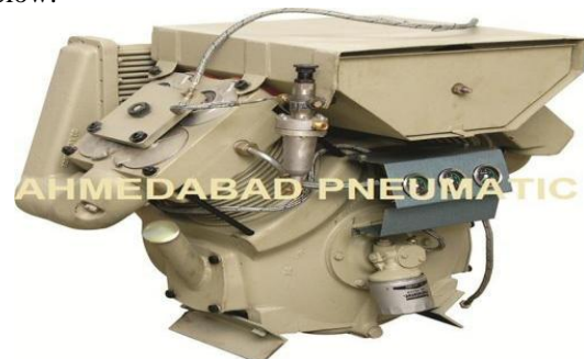
Fig. 3: Air Compressor (Type VT4).

System under study is Industrial Air Compressor (Type: VT4). In order to investigate the applicability of proposed compressor, the image of the Air Compressor (Type: VT4) is shown in the figure below: