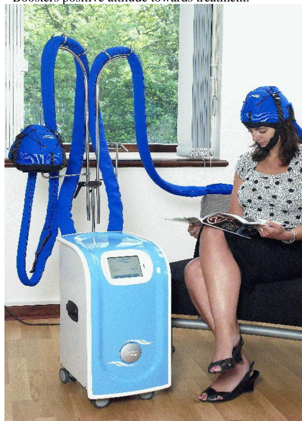
Fig3.Comfortable use of Dignicap.