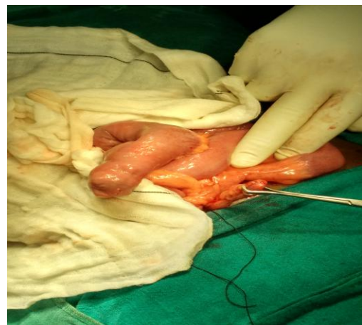
Fig. 2: Meckel's diverticulum (above 10 cms and wider circumference) and Vermiform appendix (below 7cms)