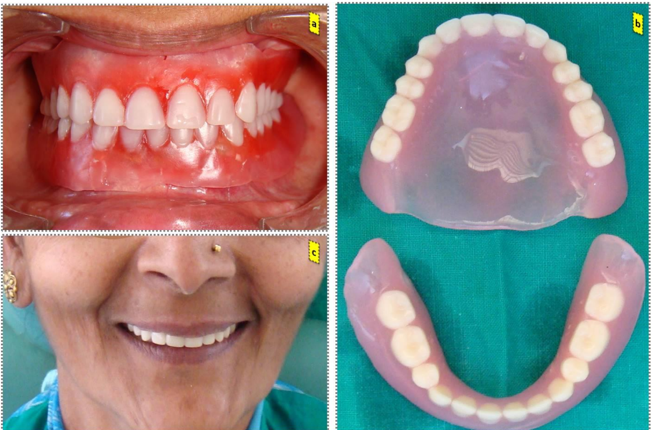
Figure 3: (a) trial denture (b) processed complete denture prosthesis (c) Final complete denture in the patient's mouth.