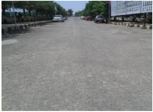
Fig 2.Rough road

The bellow fig. 2 shows that it is rough road on this road condition different readings are taken at different speed conditions which have been already explained in experimental methodology.