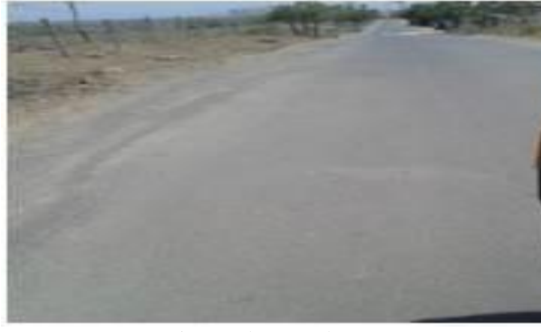
Fig 3.Urban road

different speed conditions and the road is smooth so reading obtained are efficient than rough road condition.