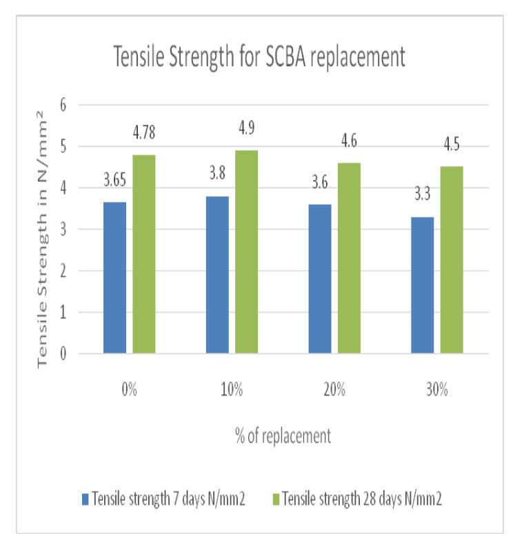
Figure 7.7 Tensile Strength of SCBA replaced Concrete