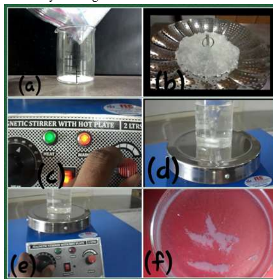
(a) Poly vinyl Alcohol (b) Gelatin (c) Magnetic stirrer (d) ,(e) A solution 8:2 ratio of PVA

The hydrogel was prepared by three repeated cycles of freeze thawing method. Freeze thaw study was carried out by subjecting the hydrogel scaffold to freezing for 24hrs in a deep freezer followed by thawing for 3hrs at room temperature. Freeze thaw study is based on the principle that excipient cannot protect the nanoparticle during the first step of freezing durng lyophilization. It is not likely to be an effective cryoprotectant. The aim of the present study is preparation of polymeric nanoparticle of PVA. When the hydrogel freezes it expands and produce pressure in the pores of the hydrogel. The major purpose of Freeze Thaw method is to enhance the stability of hydrogel. It increases porosity of hydrogel that regenerates the chondrocytes in the region of cartilage. This method also produces high durability to the gel.