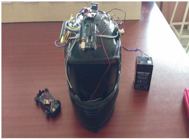
Figure.2. Unified Learning Kit