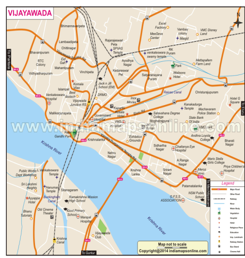
Fig.1. Vijayawada City Map II. MATERIALS AND METHODS

Measurement and evaluation of traffic noise: The noise levels were measured at with the help of a portable precision digital sound level meter (Model-SL-4010), Lutron. This instrument is primarily designed for community noise surveys. A large digital display gives a single value indication of the maximum 'A' weighted RMS (root mean square) sound pressure level measured during the previous second. It is equipped with high sensitivity Bruel and Kjaer prepolarized multi-function acoustice calibrator model 4226 condenser Measurements from 30 dB(A) to 135 dB(A) can be carried out with this instrument. The