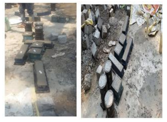
Figure 8.2: pictures indicating the flexural strength Split tensile strength test

6. Take note of the greatest load taken by shaft without break.