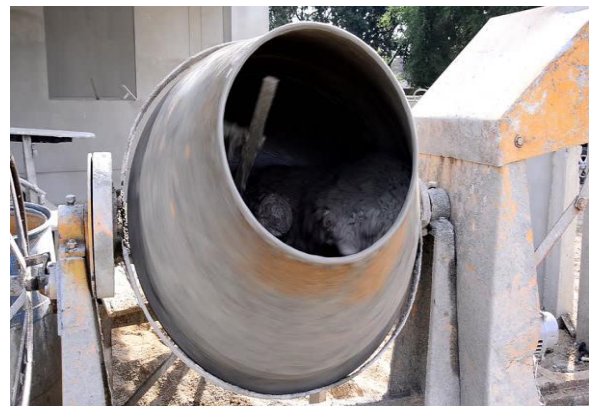
Figure 7.1: site view of mixer machine

do with prepared blend with hand blending then blend machine is accustomed to blending concrete. It is accommodation to utilize blend machine for blending little amount of cement. Creating concrete with blend machine is substantially speedier than hand blending. Ordinarily the limit of blend machine is 4 to 9 cubic feet of cement.