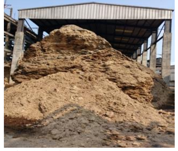
Fig 3. 2: Site view of Raw sugar cane bagasse