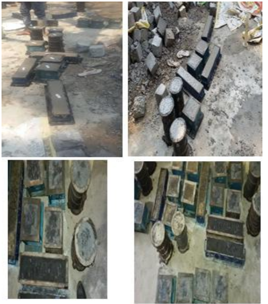
Figure 8.4: Pictures shows the Casted specimens Strength results and graphs

Strength results & graphs hardened properties of trail mixes sugarcane bagasse ash as an admixture