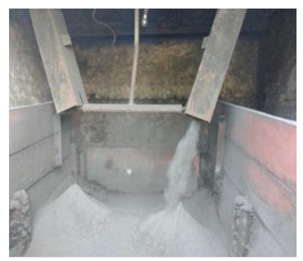
Fig 3.3: Site view of Burnt sugarcane bagasse ash Table 3. 1: Chemical composition, loss on ignition, and specific gravity of OPC and SCBA.