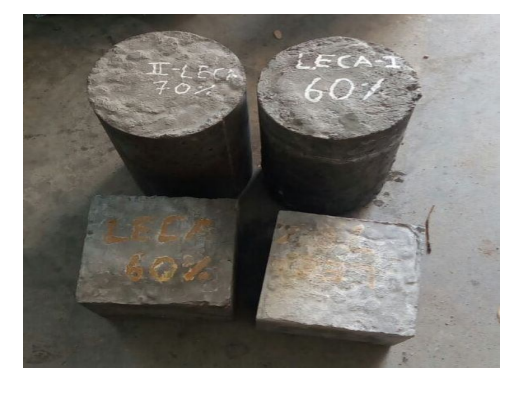
Fig 4 Cube and Cylinder Specimen