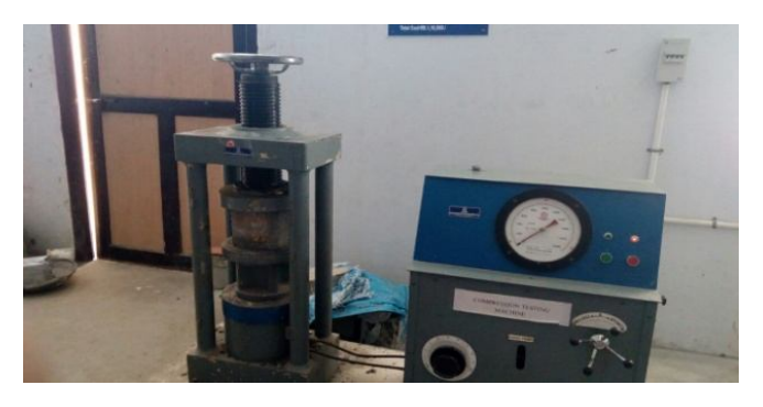
Fig 6 Testing Of Cube