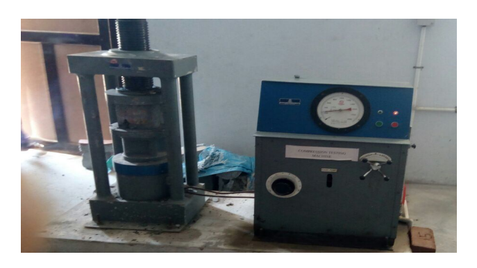
Fig .5 Compression Test For Cube