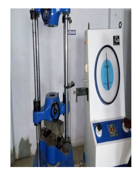
Fig.6.3 Flexural test on geopolymer concrete

Flexural strength = M/ZWhere, M = Moment (Nmm) Z = Section modulus (mm<sup>3</sup>)