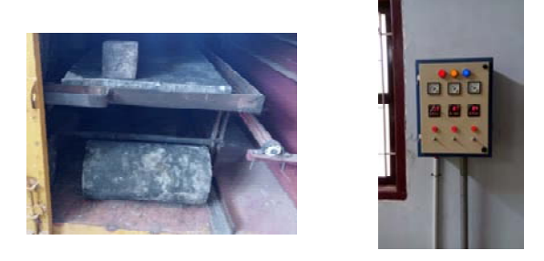
Fig.6.1 Curing of geopolymer concrete

The geopolymer concrete was cured under heated 80^{\circ} C for 24 hours, used in heat chamber.