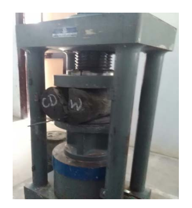
Fig.6.2 Tensile test on geopolymer concrete