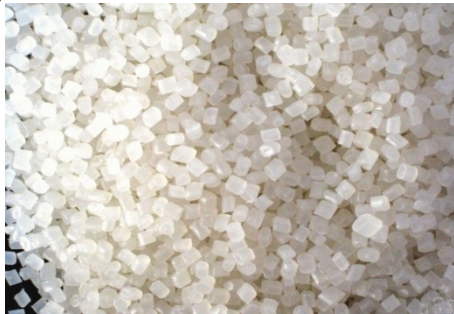
Low Density Polyethylene(LDPE)