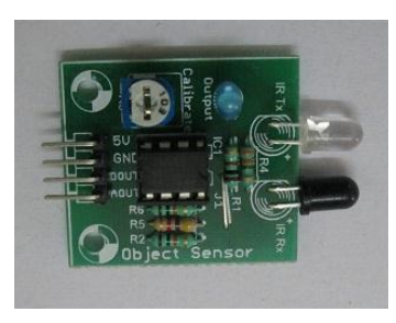
Fig 3: Reflection sensor

Transmitter and receiver are incorporated in a single housing. The modulated infrared light of the transmitter strikes the object to be detected and is reflected in a diffuse way. Part of the reflected light strikes the receiver and starts the switching operation. The two states – i.e. reflection received or no reflection – are used to determine the presence or absence of an object in the sensing range. This system safely detects all objects that have sufficient reflection. For objects with a very bad degree of reflection (matt black rough surfaces) the use of diffuse reflection sensors for short ranges or with background suppression is recommended.