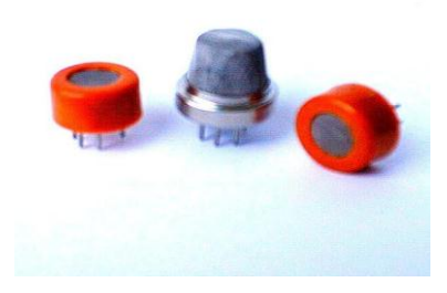
Fig 2: Smoke sensor

They are used in gas leakage detecting equipments in family and industry, are suitable for detecting of LPG, i-butane, propane, methane, alcohol, Hydrogen, smoke. The surface resistance of the sensor Rs is obtained through effected voltage signal output of the load resistance RL which series-wound. The relationship between them is described: RsRL = (Vc-VRL) / VRL