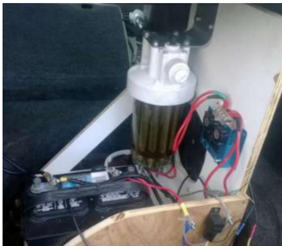
Fig 5: Finished Generator in Trunk

To accomplish “Plan A”, running the engine just with hydroxy gas, installation was very complicated. The fuel rail had to be disconnected from the fuel line to be connected to the new hydroxy gas line, also one of the sides had to be sealed in order to avoid any loses of the gas. At the same time, the fuel pump relay was removed to prevent the pump to work and avoid any leak of gasoline. For “Plan B”, running the engine on gasoline and hydroxy gas at the same time, installation became fairly simple. The hose was connected straight to the air intake manifold.