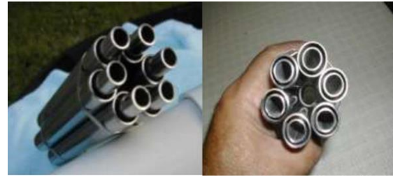
Fig 2: Turbo Star Pipes

Many design alternatives were looked at to determine the best way to generate the highest amount of hydrogen possible. The chosen design model will be re-evaluated to seek optimum efficiency. Sizing plays an important aspect of the design, specifically the stainless-steel tubes that will submerge under the water. The optimal tube design has been chosen for this project. An alternative design using parallel plates will also be tested to assure that we have chosen the best design that is suitable for our application.