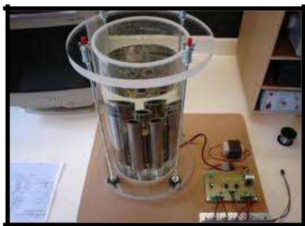
Fig 1: Wet System

The wet system design is more complicated to manufacture. This design might be more expensive since the steel parts and their arrangement are more challenging to produce. This system uses two different diameter tubes in order to accommodate one inside the other with different polarities, as illustrated in Figure