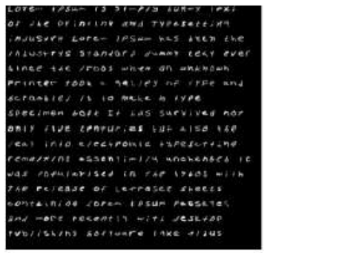
FIG 1.1 - OUT PUT IMAGE OF THE PROGRAM