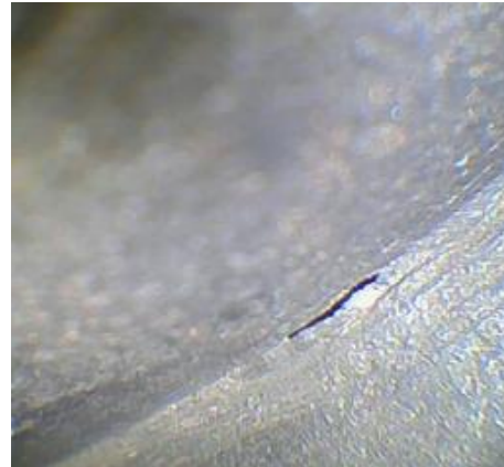
Fig 3: Puncture in the stuffing box