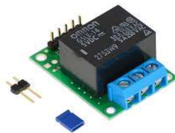
Fig – 4.4 Relay switch

A relay is electrically operated switch. Many relay uses electromagnet to mechanically operate a switch. Other operating principle such as solid state delay is used. A contractor type of relay is used to handle high power supply. If the coil is energized with alternating current, some method is used to split the flux out of phase components which add together, increasing the minimum pull on the armature during AC cycle. The relay will terminate the power supply.