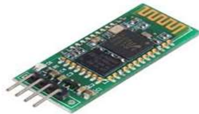
Fig – 4.3 Bluetooth

Wireless communication is the transfer of information or power between two or more points that are not connected by an electrical conductor.