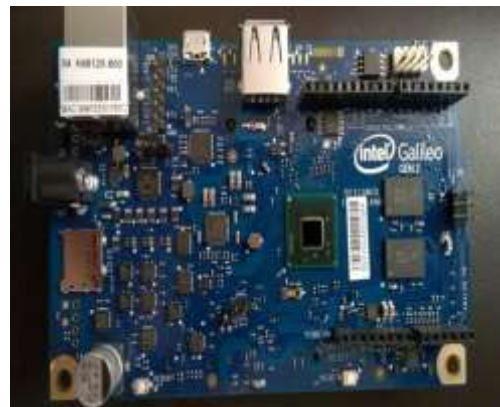
Fig – 4.1 Intel Galileo Gen 2

The Intel Galileo Gen 2 supports Arduino readymade hardware expansion cards. It is open source software from where the coding is very easy. The coding in Intel Galileo Gen 2 and Arduino are same. The only drawback in Intel Galileo Gen 2 is the cost which is higher.