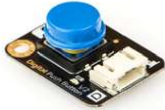
Fig – 4.2 Digital button sensor

"force" a start button to be released. This method of linkage is used in simple manual operations in which the machine or process have no electrical circuits for control.