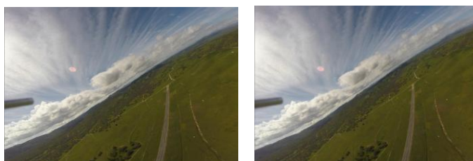
Fig.2. Extraction of frames from video data set

The different approaches are suitable for characterizing small moving objects since their motions can be estimated in local regions between frames. Motion-based approaches are divided into two main categories: