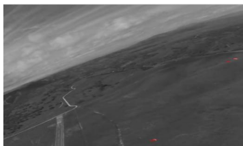
fig.4. Illustrates about the detection of moving object which is indicates by red bounding box.

Pruned points are cluster according to spatial proximity. By generate the bounding box for each cluster of points which represents our detection for a single moving object.