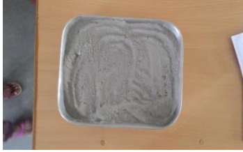
ANATOMY OF FLY ASH