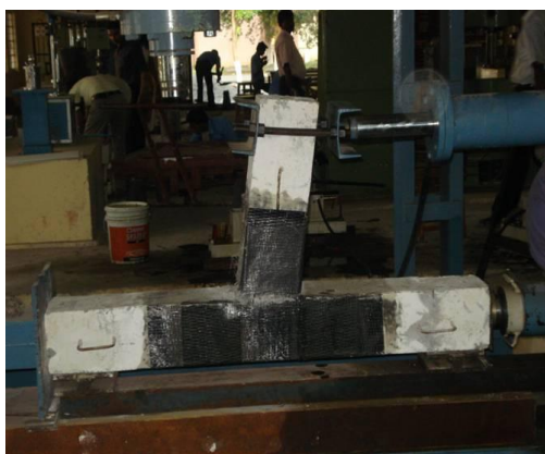
Figure 9 Typical View of Failed Specimen Retrofitted with Sisal Fiber Sheet