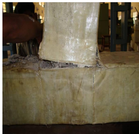
Figure 8 Typical View of Failed Specimen Retrofitted with GFRP Sheets