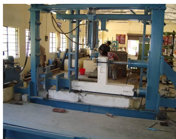
Figure 6 Typical View of Test Setup

The beam column joint specimens were tested in a loading frame with the column in the horizontal plane. Both the ends of the column were hinged using roller plates. The axial load was applied at one end the column using a hydraulic jack of 500 kN capacity and the load was measured using calibrated dial gauge. The other end of the column was supported by the steel bulkhead attached to the loading frame. A transverse static or push & pull load was applied at the free end of the beam through a push and pull hydraulic jack of capacity 400 kN to develop a bending moment at the joint. The deflection at the free end of the beam was recorded at regular load intervals upto a control deflection. The number of beam-column joint specimens tested during this investigation is 6. Figure 6 shows the typical view of test setup for the beam-column joint specimen.