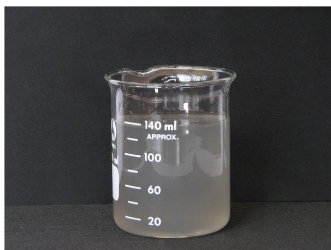
Figure 5 Sodium silicate solution