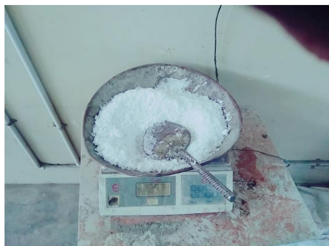
Figure 4 Sodium hydroxide flakes

Secondly, the cost of sodium hydroxide solid is high and preparation is very caustic. Similarly to achieve desired degree of workability, extra water is required which ultimately reduce the concentration of sodium hydroxide solution. So, the concentration of sodium hydroxide was maintained at 13 M while concentration of sodium silicate solution.