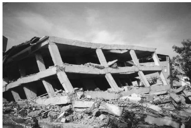
Figure 1 Collapsed Reinforced Concrete Structure during Kocaeli Earthquake (Reference: www.thecivilbuilders.com )

expectancy of many existing buildings. Figure 1 shows a reinforced concrete structure that collapsed during the 1999 Kocaeli earthquake in Turkey in which failure of joints appears to be the major contributor to such collapse. Figure 2 shows a typical view of beam-column joint failure.