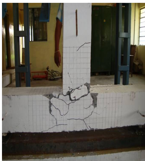
Figure 7 Typical View of Failed Control Specimen

Fig. 7, Fig. 8 , Fig. 9 , & Fig. 10 show the typical views failed control and retrofitted specimens