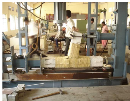
Figure 10 Typical View of Failed Specimen Retrofitted with CFRP Sheet